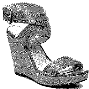
Permitted Style Shoe

Please Note: High-heeled shoes will not be allowed on the field surface, high-heeled shoes may puncture the turf and may cause damage to the field surface. Please inform any guests that you may be inviting of this policy. Wedge style heeled shoes are permitted.